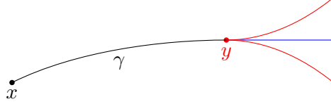
Figure 1: Picture of the cut locus (blue) and conjugate locus (red) from x on a surface.